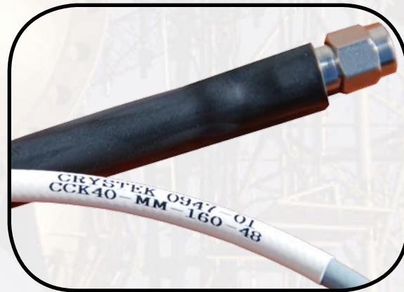
Electrical Test Data Supplied With Each Cable Assembly